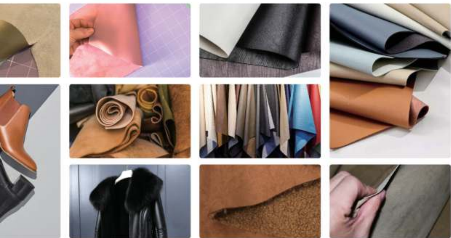
Applicable material ▲